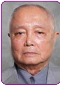
PP Palma ANGELING