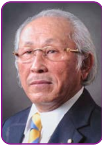
PDG Seiichi MORITA