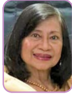
PP Veeh Balajo