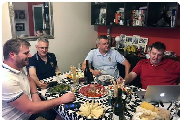
Rotary members in Serbia take part in a wine tasting event, advancing understanding and deepening connections between clubs involved in the Hearts of Europe initiative.

Editor-in-Chief / Past President Rotary Club of Baguio