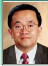
Captions by EIC Raffy Chan