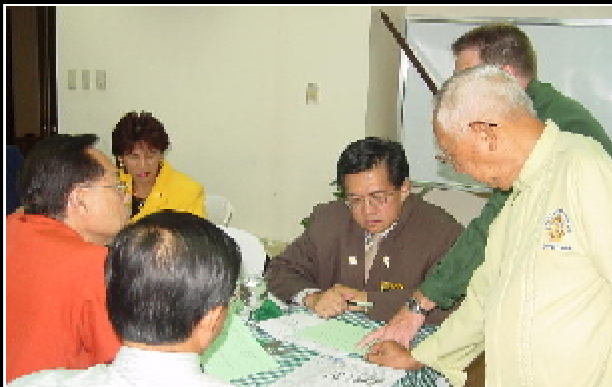
Post Regular Meeting Activity One: RCB Membership Committee Meeting.