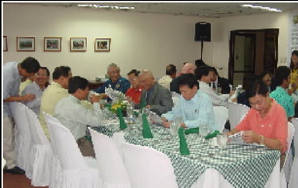
With the Benguet Room just a few more seats vacant, the meeting was just about ready to begin...