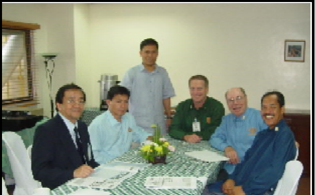
Post Regular Meeting Activity Two: Rotary Club of Baguio Board Meeting.