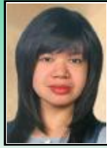
Captions by AEIC Dhory Vicencio