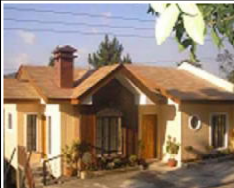
Actual picture of Country Atrium House-modified