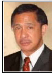
PP DIONY CLARIDAD