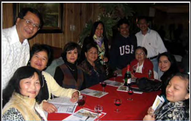
It was a chilly evening but the ladies are enjoying warm fellowship with PP Chris and PP Diony.