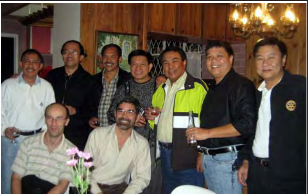
No one can deny that this is indeed a Grand Fellowship with our Rotarians flashing those smiles.