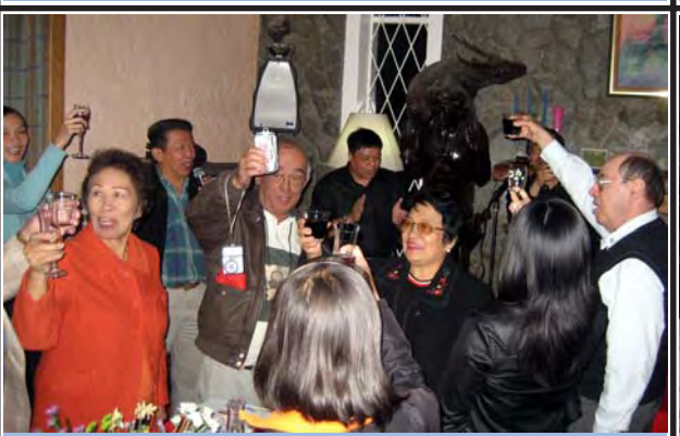
Everybody was in high spirit...Cheers! for the birthday and anniversary celebrants.