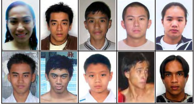
See Pages 6-7 for profile of our awardees.