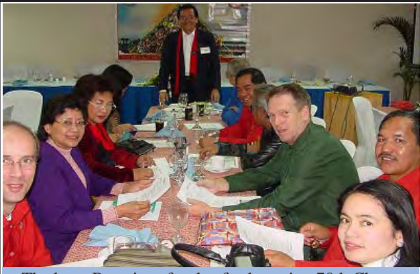
The busy Rotarians for the forthcoming 70th Charter Anniversary of RCB.