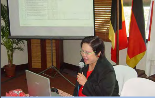
Dir. Cecille made a concise presentation on Membership including the future activities on recruitment.