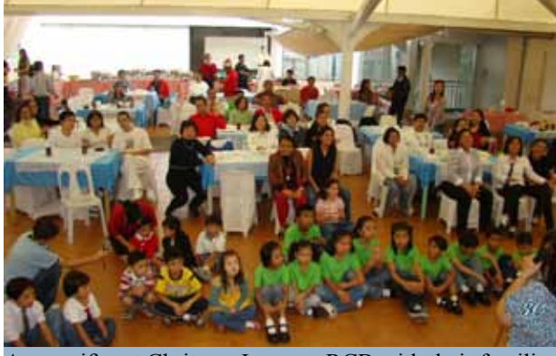
A magnificent Chritmas Image... RCB with their families and kids celebrating with them.