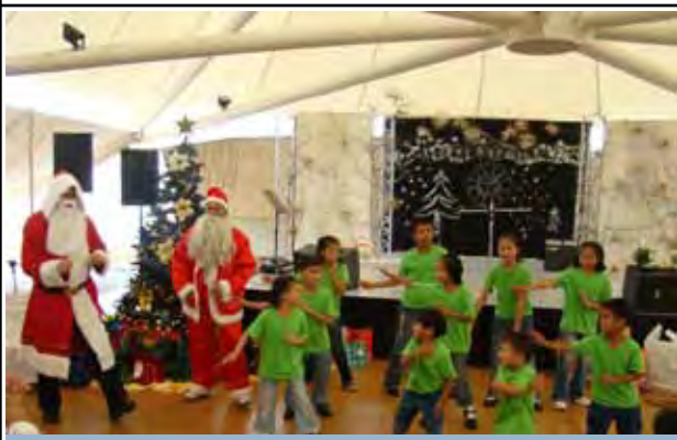
A couple of santa claus & cute kids dancing... is Santa Joe really dancing?