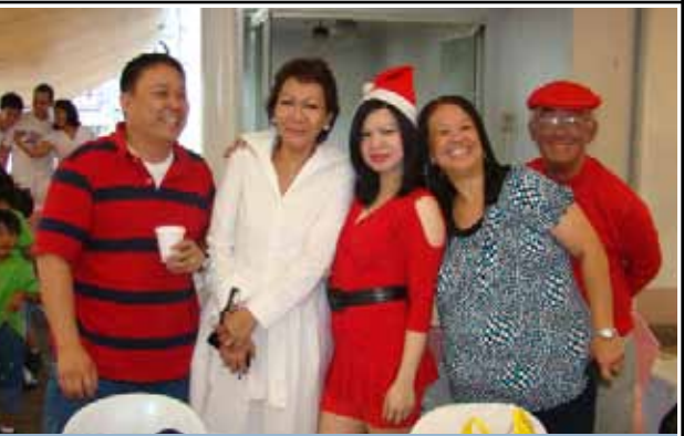
Now, this is not part of entertainment... this is the new generation of brat pack! RCB's very own