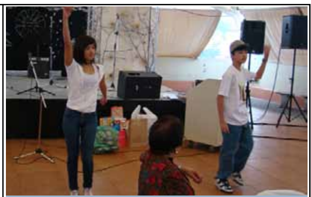
Pres. Bert, why can't we see your dancing with your kids? But hey, they are fantastic!