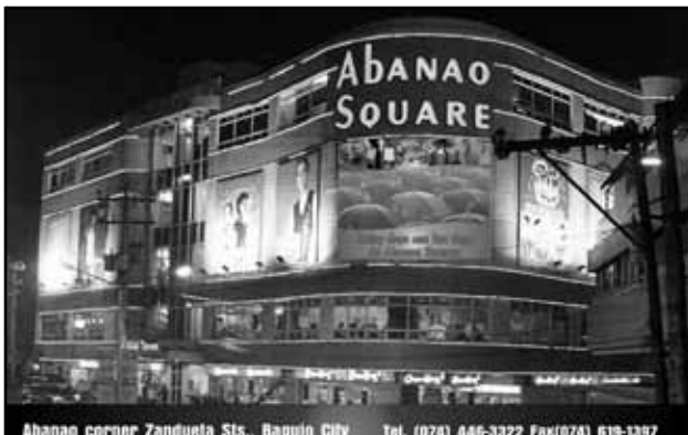
Abanao corner Zandueta Sts., Baguio City. Tel. (074) 446-3322 Fax(074) 619-1387