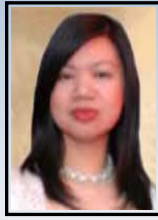
Captions by EIC Dhory Vicencio