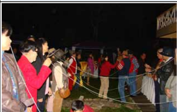
Couples lined up for an exciting game of string eating. It was a real challenge for them!