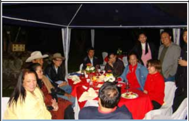
This is fellowship to the fullest of RCB, spouses and anns...such a magnificent scene!