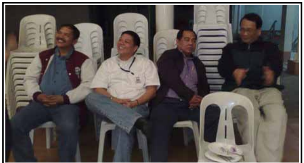
The "Presidential Security Guards"