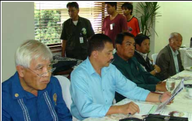
What's common in this pic? Everybody is serious... not a single smile...I wonder why?