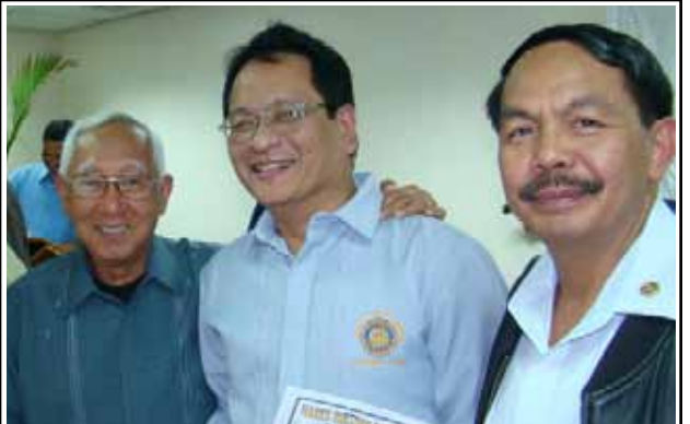
President's Time will not be complete without a birthday greeting - Happy Birthday PP Chris!