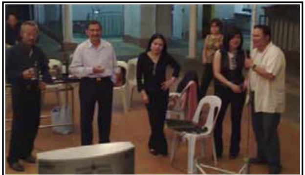
The Videoke time