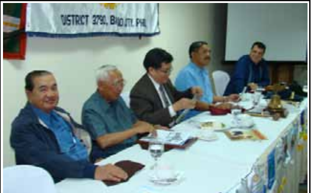
And what's common in this pic? Everybody's smiling and loving it at the head table.