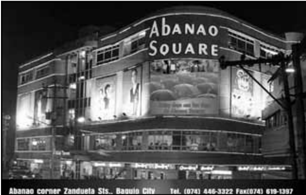
Abanao corner Zandueña Sts., Baguio City. Tel. (074) 446-3322 Fax(074) 619-1387