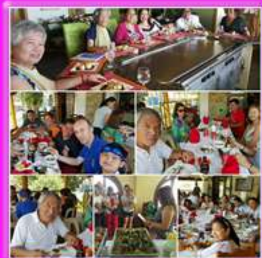
Out of town venue meeting in Sierra Vista with the RCB