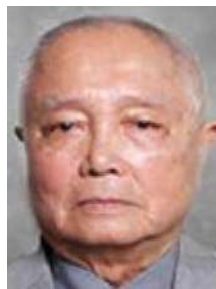
PP Palma ANGELING