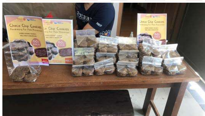
Rotaractors-in-Action: Selling Cookies at Abong, Baguio