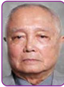
PP Palma ANGELING