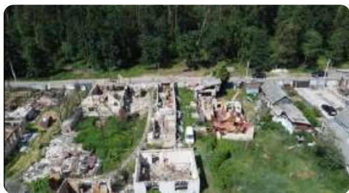
Devastation in Moshchun