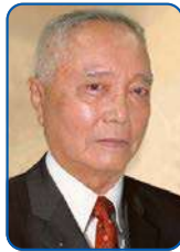
PP Palma ANGELING