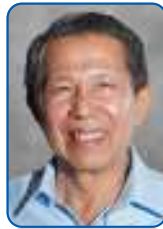
PP Loreto PANGILINAN