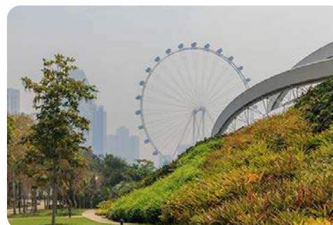
Ferris Wheel seen from the Gardens By the Bay

Your Rotary Convention adventure will start at Changi Airport, known as the World's Best Airport with its magnificent rain vortex waterfall. If you arrive early, you will have time to take a stroll through the beautiful Gardens by the Bay. Once you have settled in, enjoy a refreshing Singapore Sling, served at the iconic Raffles Hotel. Savour a dozen satays with delicious peanut sauce, (you can't stop at just one). And do try Singapore's famous Chicken rice, Singapore noodles, or chilli crab. For dessert, you won't be able to resist Singapore's favorite Ice cream sandwich. If you stay a little longer you can relax and enjoy the hiking trails, parks and recreational areas, the night zoo, or go shopping.