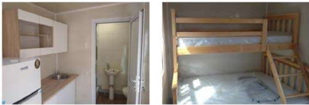
The interior of a modular home

"The modular house goes to the next family, or maybe gets converted into a medical station or a classroom," Balfour says.