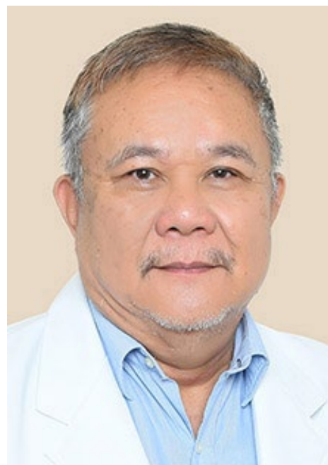
PRES. JOE URSUA