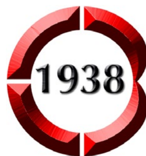
Updated 2007 version