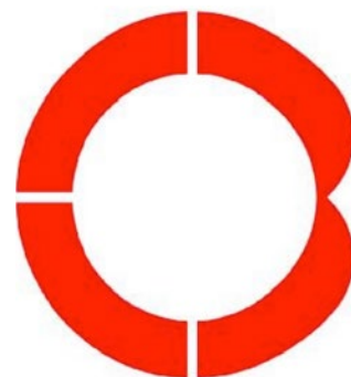
Early 2005 version

Whenever we see the RCB logo displayed—whether on our banner, bulletin, or lapel—we are reminded of who we are, the ideals we stand for, and the enduring bond we share . Truly, it is not only a logo, but a living symbol of our continuing Rotary journey.