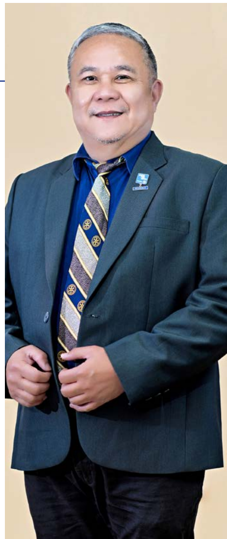
PRES. JOE URSUA

Salamat po, and see you all at our next meeting!