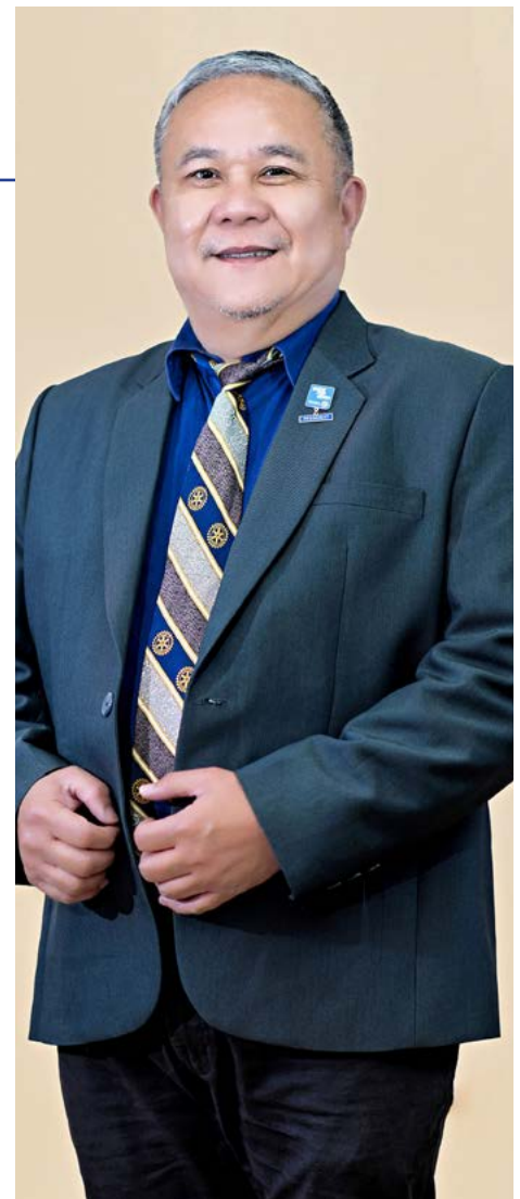
PRES. JOE URSUA