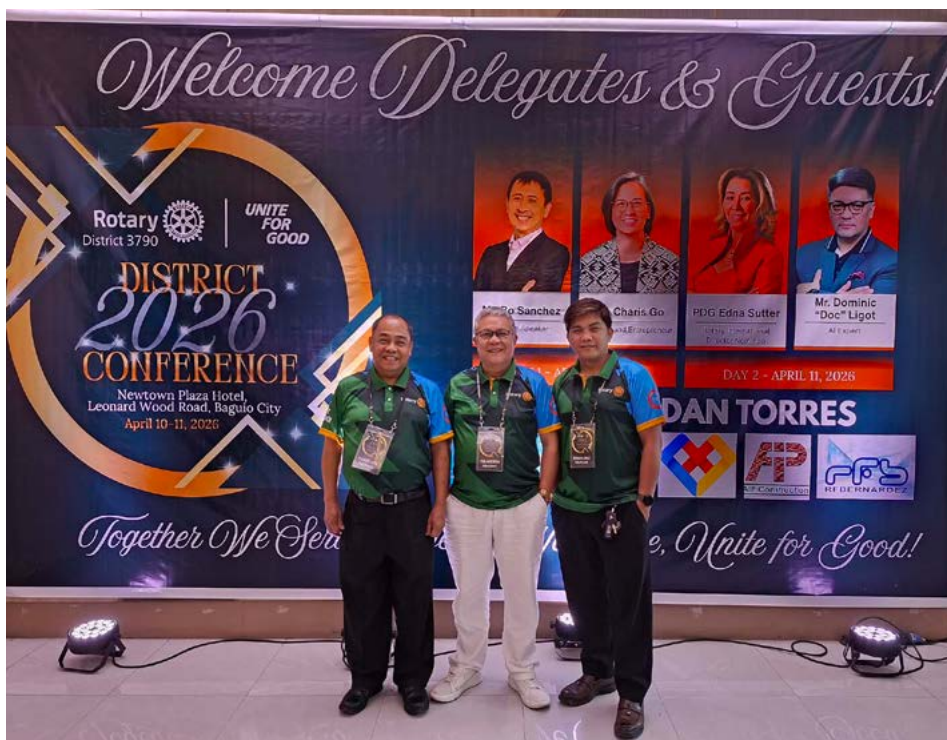
Early DisCon Attendees, 10 April 2026, Hotel Supreme Conception Plaza