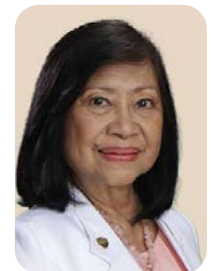
PP Veeh Balajo April 24