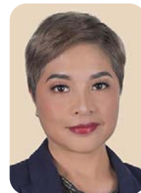
PP Atom Mendalla April 21