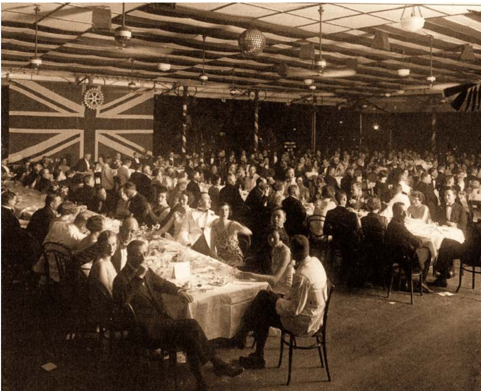
Charter Dinner of 1930 of the Rotary Club of Singapore

And so, from that one table in Chicago to gatherings across the world, including our own here in Baguio, Rotary continues—not merely as an institution, but as a living fellowship. One that endures because it is built on something timeless: people coming together in trust, goodwill, and shared purpose to create a better world for all, today and for future generations.